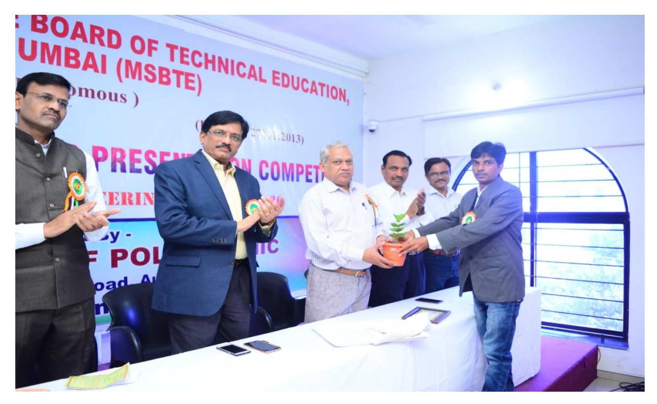
Guest Felicitation Winner and Runner with Prizes