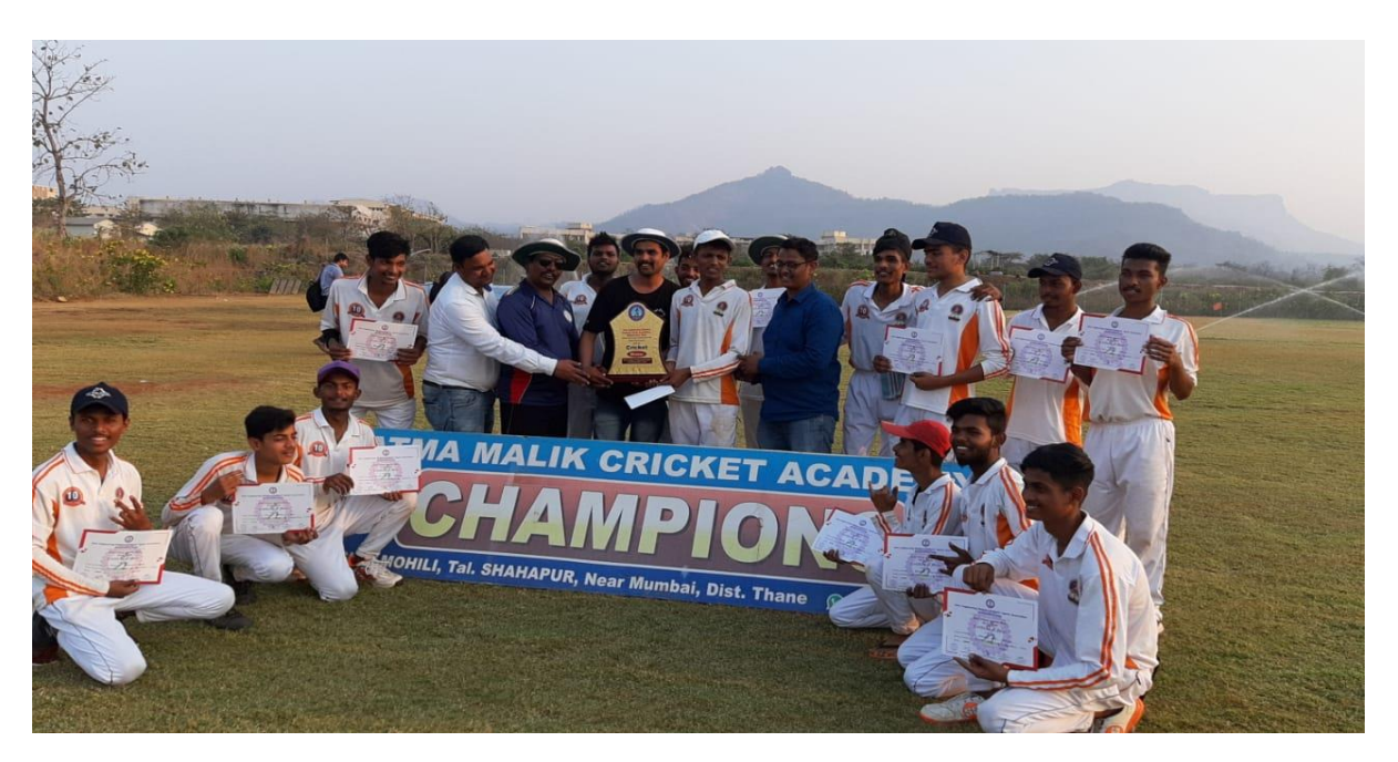
Students Participated in IDEESA Won the State level Inter zonal Match