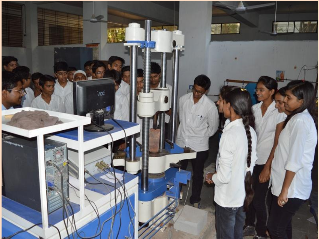
UTM Machine Lab